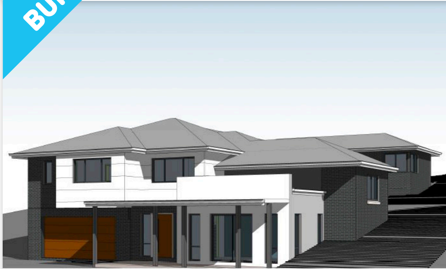
Artist's impression. Perspective is indicative only.